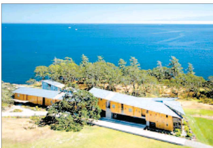
$24 million: Described as an "architectural sculpture," this 8,000 square-foot Metchosin home sits on 67 acres and is the second most expensive house for sale in the country.