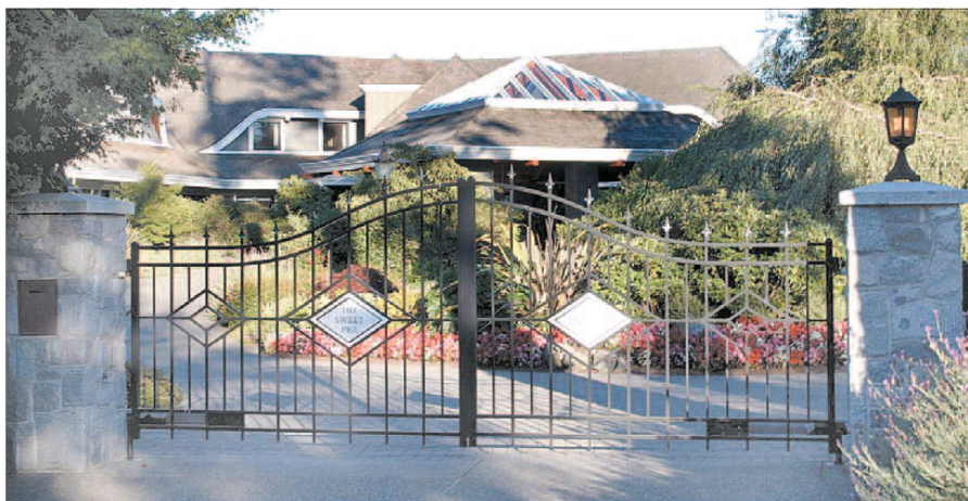
The Sweet Pea at 3195 Humber Rd. in Oak Bay's Uplands neighbourhood boasts 450 metres of rocky oceanfront, shown in the aerial photograph above, as well as an indoor swimming pool and spa and doors covered in gold leaf.